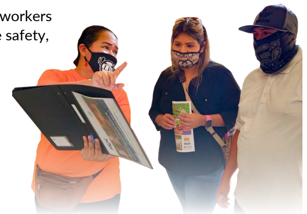
A CHW from the VdS program in San Bernardino, CA trains workers.