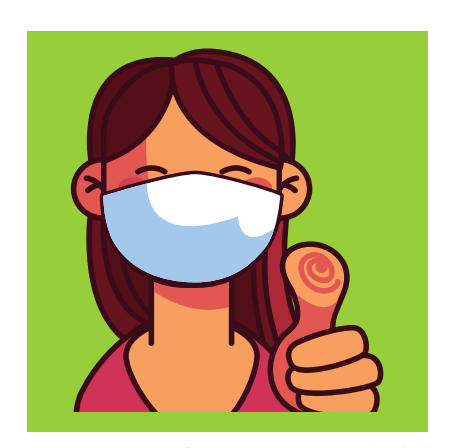
Congratulations, you did your part in keeping yourself and others safe!