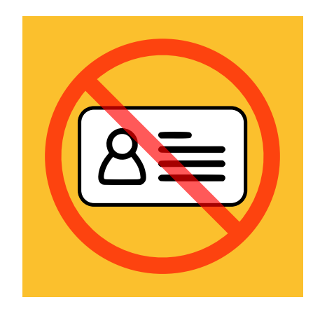
It's free for most everyone, including immigrants. No ID is required to get the vaccine.