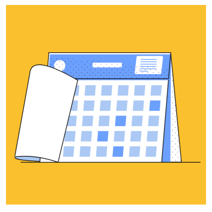
It takes several weeks before the vaccine protects you.