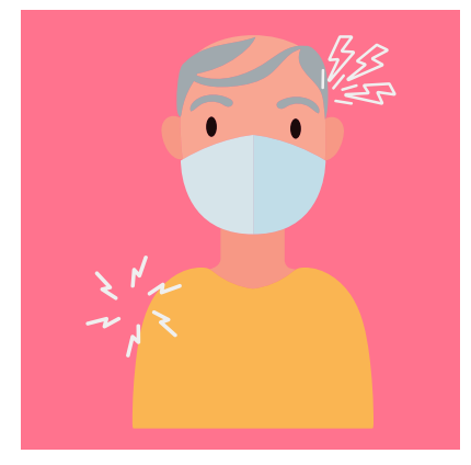
You may have a sore arm, headache, fever or chills after receiving the vaccine.