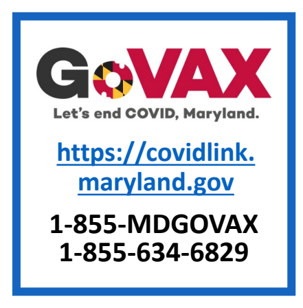
Make an appointment when it's your turn.