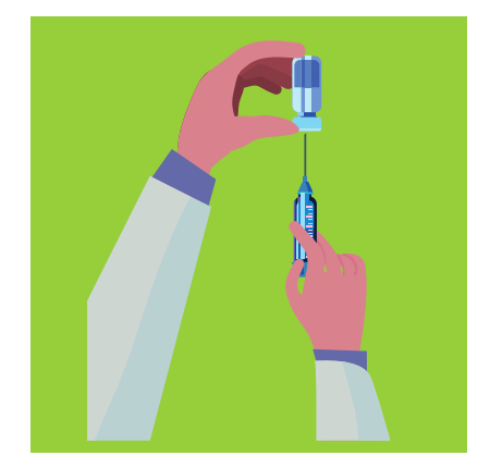
There are several COVID-19 vaccines. Some require a 2<sup>nd</sup> dose. All are safe and effective.