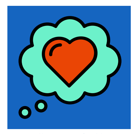
You will start to feel better after a couple of days.