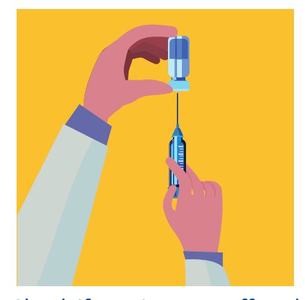
Check if vaccines are offered for free at your state or local health department or pharmacy.