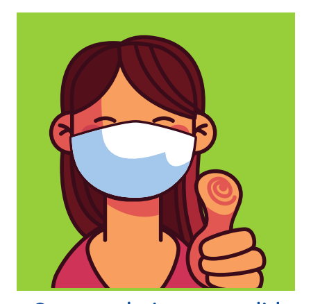
Congratulations, you did your part in keeping yourself and others safe!