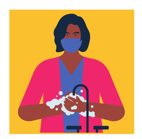
Continue to wear a respirator in crowded spaces and wash your hands.