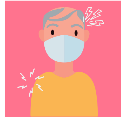
You may have a sore arm, headache, fever or chills after receiving the vaccine.