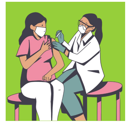
Check with your health care provider to determine what COVID-19 vaccine you need.