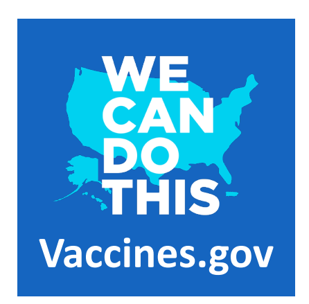
Find a location near you! Search using the map on www.vaccines.gov/search