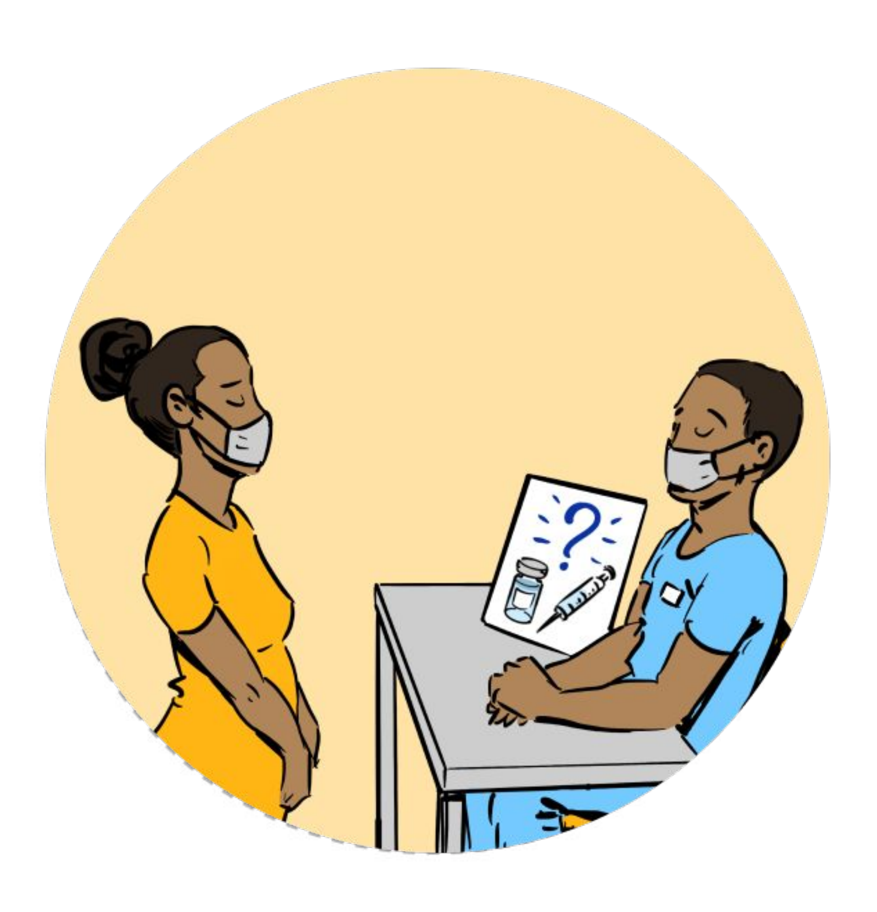
The COVID-19 vaccines are free, no matter your immigration status.