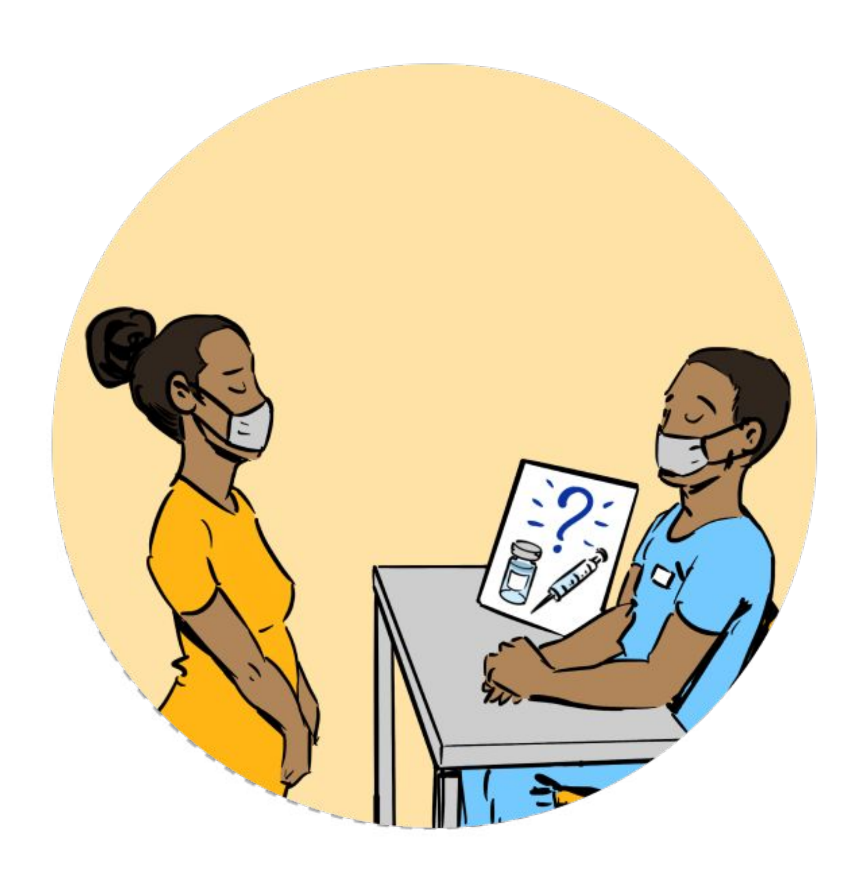
Vaksen COVID-19 la gratis, kelkeswa sityasyon ou nan imigrasyon.