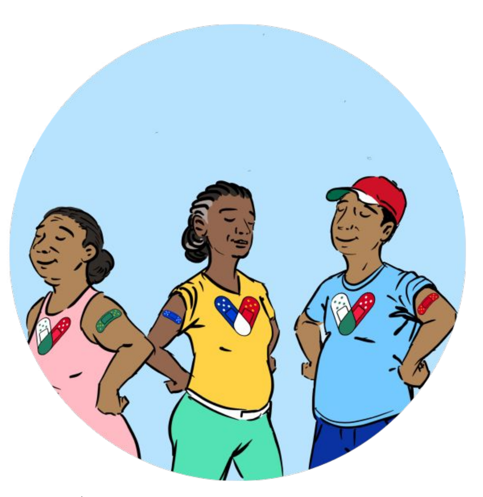
Aprè ou fin pran vaksen an, li posib pou ou gen doulè nan bra, tèt fè mal, lafyèv ak frison.