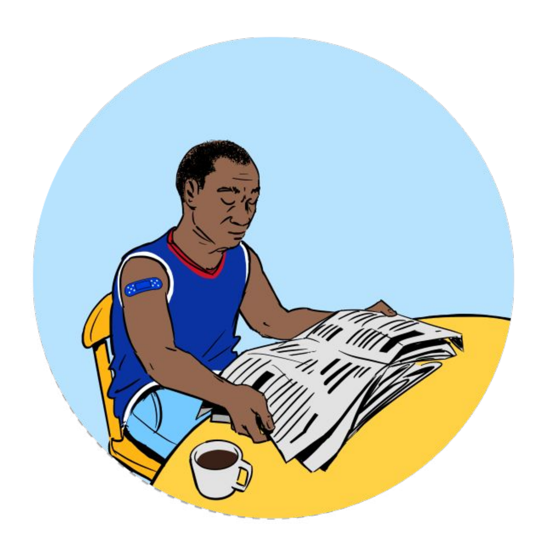
The COVID-19 vaccines are safe and effective.